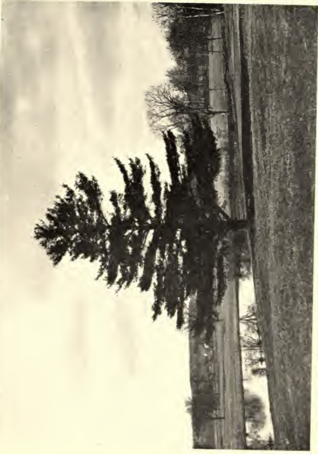
SITE OF THE ROWLANDSON GARRISON The tree stands upon the spot